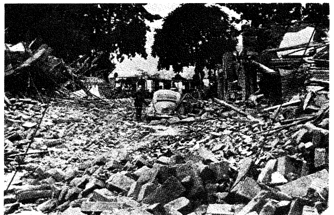
CASMA, a town on the coast was almost entirely destroyed