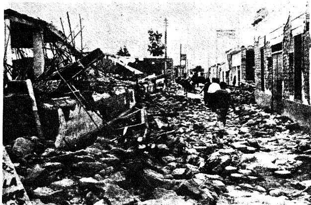
THE shock came in fast waves. A side-street of a coastal town